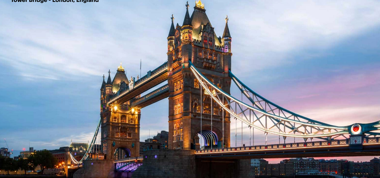
Tower Bridge - London, England

Congratulations to our 3 contest winners! We loved seeing everyone's creative and functional home workstations. Keep sharing your work from home experiences with us by using #CarrRemoteExperience .